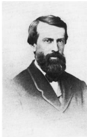
William Procter, Jr., Philadelphia. "Father of American Pharmacy."

Elected Corresponding Secretary at New York meeting. President , A. P. H. A., 1862-1863.